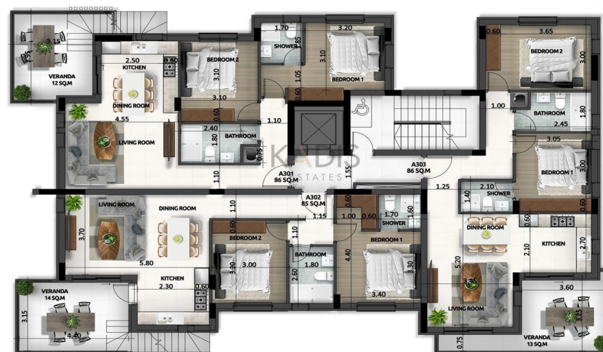
Floor Plan 3rd