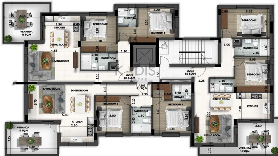
Floor Plan 2nd