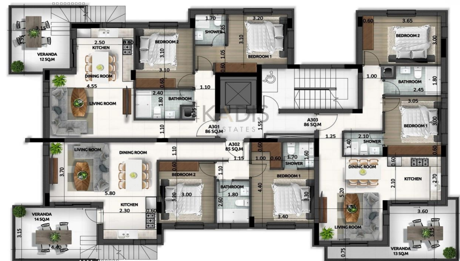
Floor Plan 3rd