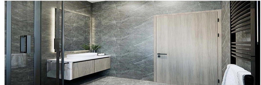
Purple International Real Estate