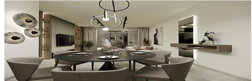
Purple International Real Estate