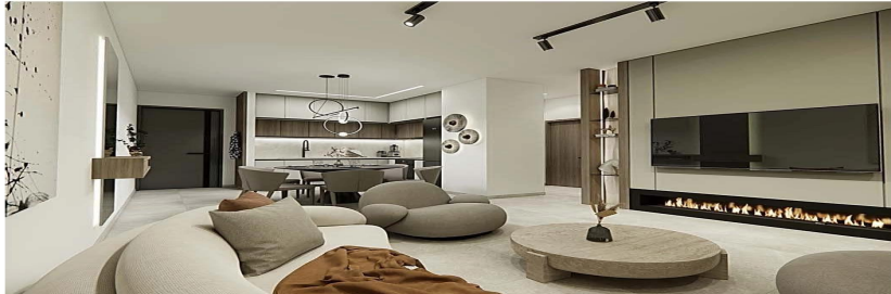
Purple International Real Estate