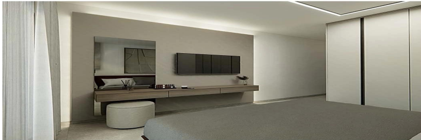
Purple International Real Estate