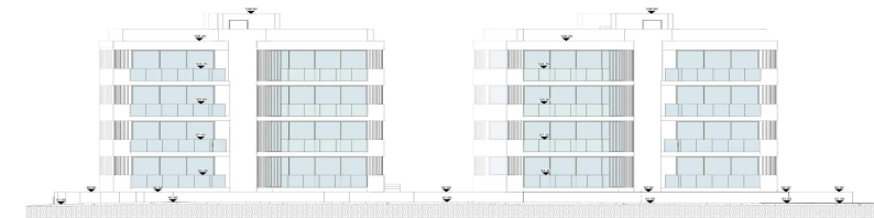
2 ELEVATION FROM THE ROAD 1:100