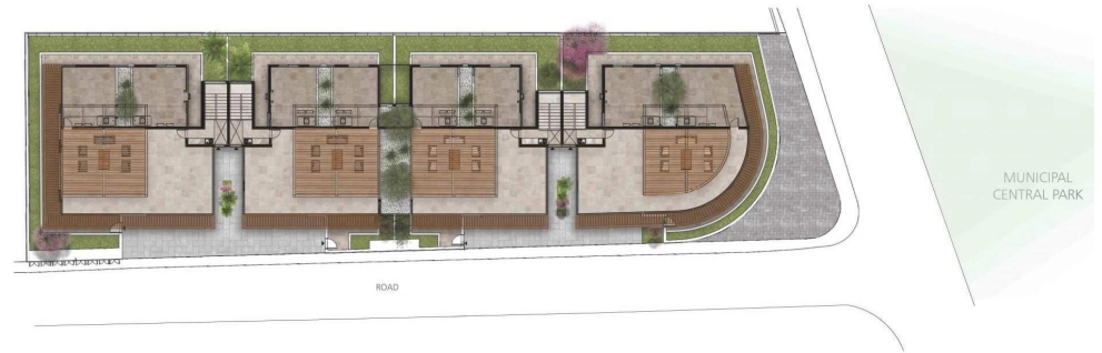
MUNICIPAL CENTRAL PARK