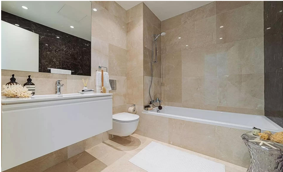
block a floor 4