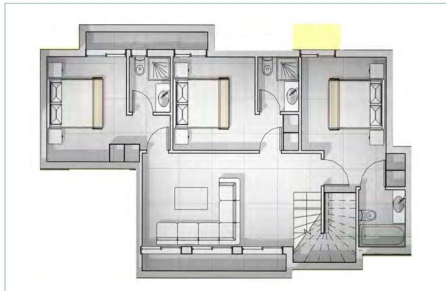
PRELIMINARY LOWER GROUND FLOOR