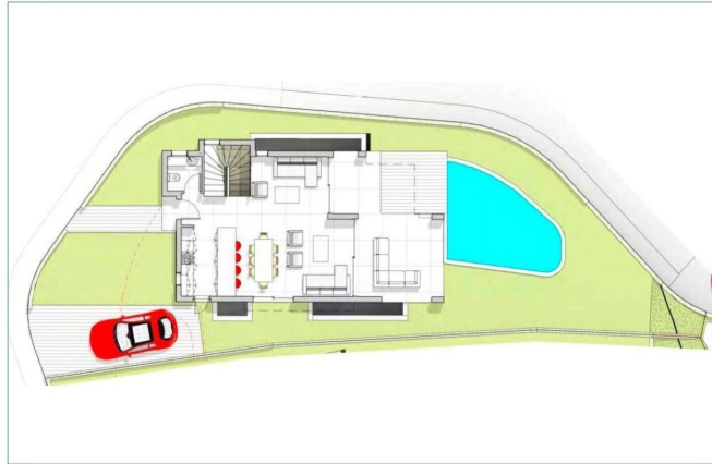
PRELIMINARY GROUND FLOOR