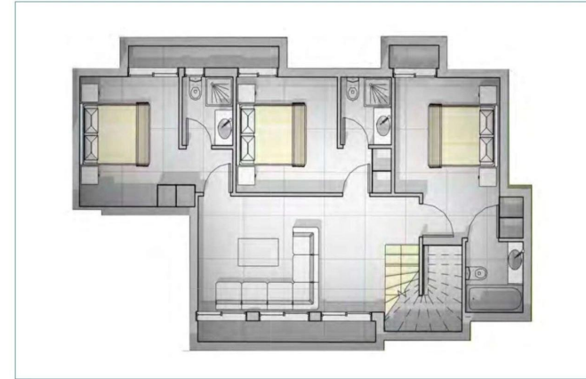
PRELIMINARY LOWER GROUND FLOOR