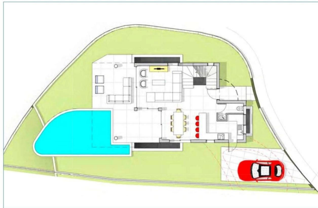
PRELIMINARY GROUND FLOOR