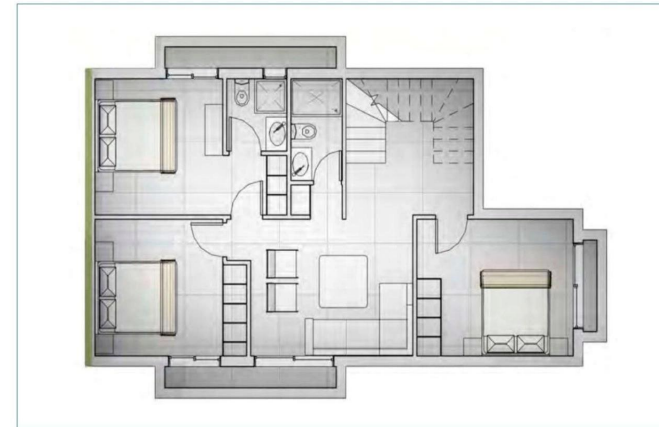
PRELIMINARY LOWER GROUND FLOOR