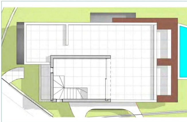
PRELIMINARY ROOF PLAN