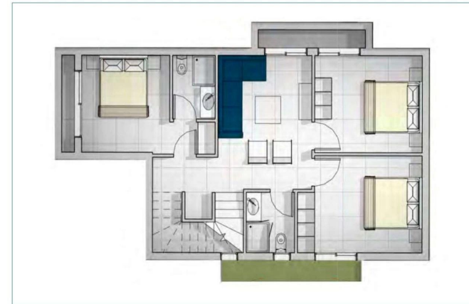
PRELIMINARY LOWER GROUND FLOOR