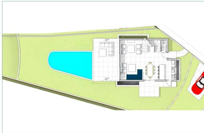
PRELIMINARY GROUND FLOOR