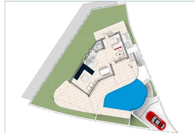
PRELIMINARY GROUND FLOOR