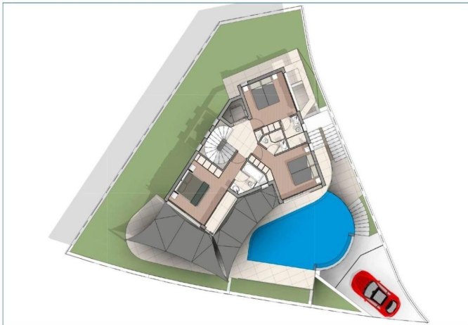
PRELIMINARY FIRST FLOOR