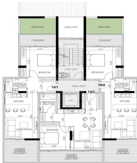
1st Floor 101 102 103 1 Bedroom Apartments