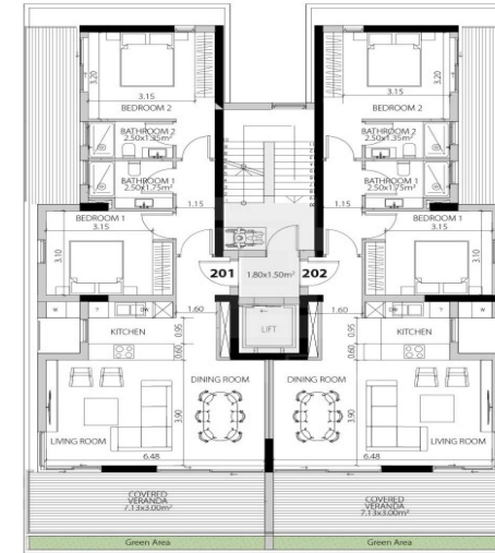
2nd Floor 201 202 2 Bedroom Apartments