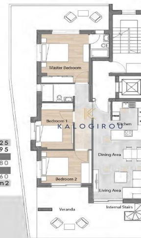
Fourth Floor Plan