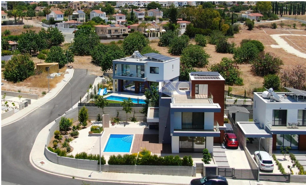
Villa No 6