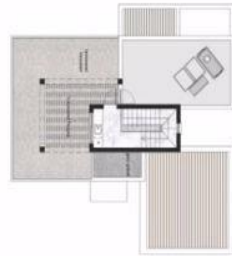
ROOF GARDEN PLAN