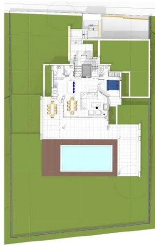
PRELIMINARY GROUND FLOOR