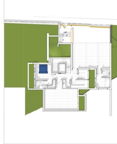
PRELIMINARY LOWER GROUND FLOOR