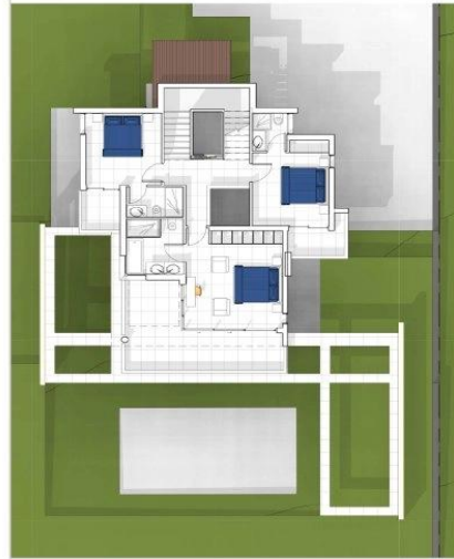
PRELIMINARY FIRST FLOOR