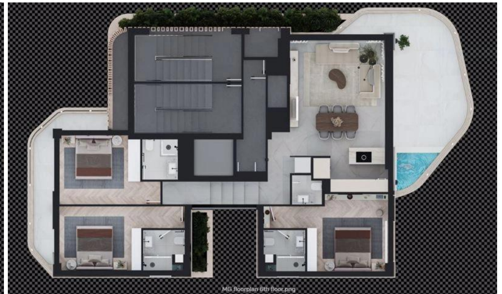
MG floorplan 6th floor.png