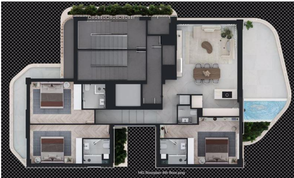
MG floorplan 4th floor.png