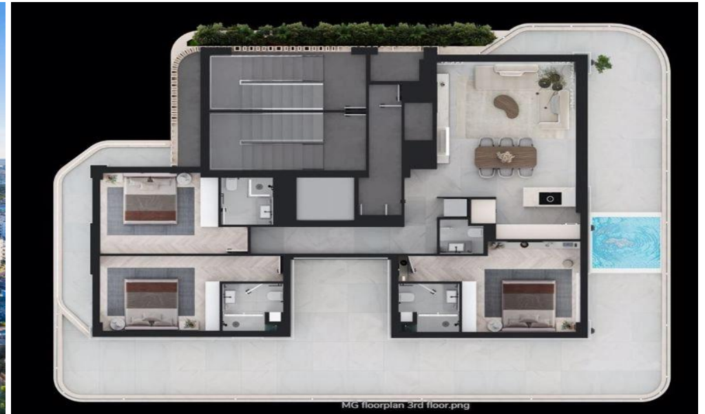
MG floorplan 3rd floor.png