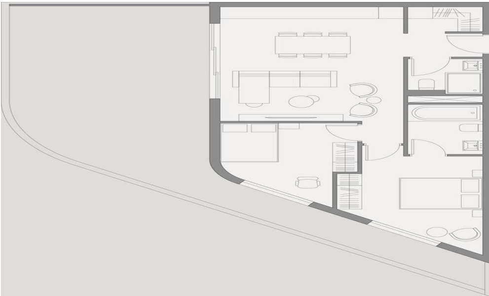
Indicative Residential Floor Plans Building A (1 st , 5 th , 6 th , 7 th floor)