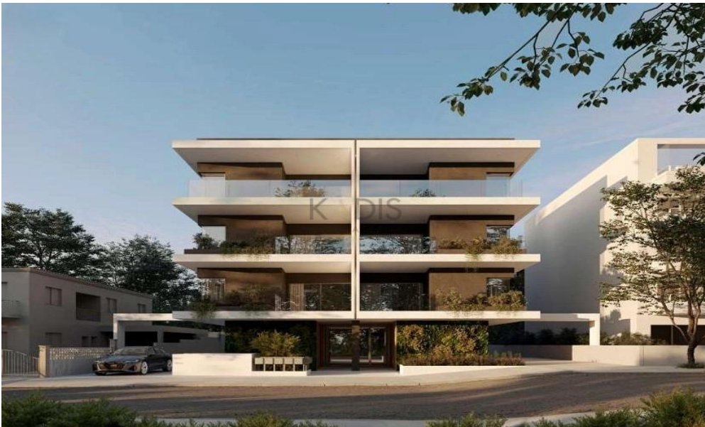
Comfortable parking layout.