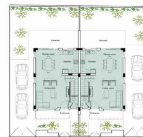
ΚΑΤΩΗ ΙΣΟΓΕΙΟΥ Ground Floor