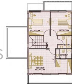
ΚΑΤΟΨΗ ΟΡΟΦΟΥ HOUSE 4