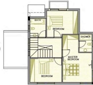
ΚΑΤΟΨΗ ΟΡΟΦΟΥ HOUSE 3