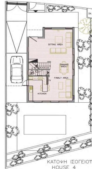
ΚΑΤΟΨΗ ΙΣΟΓΕΙΟΥ HOUSE 4