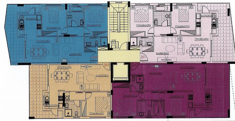
ΚΑΤΟΥΗ 2ου ΟΡΟΦΟΥ