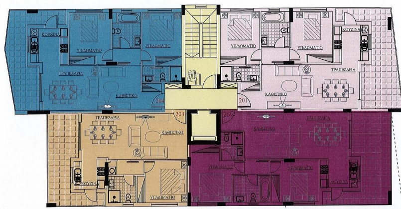
ΚΑΤΟΨΗ 2ου ΟΡΟΦΟΥ