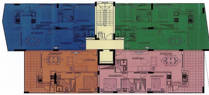
ΚΑΤΟΨΗ 3ου ΟΡΟΦΟΥ