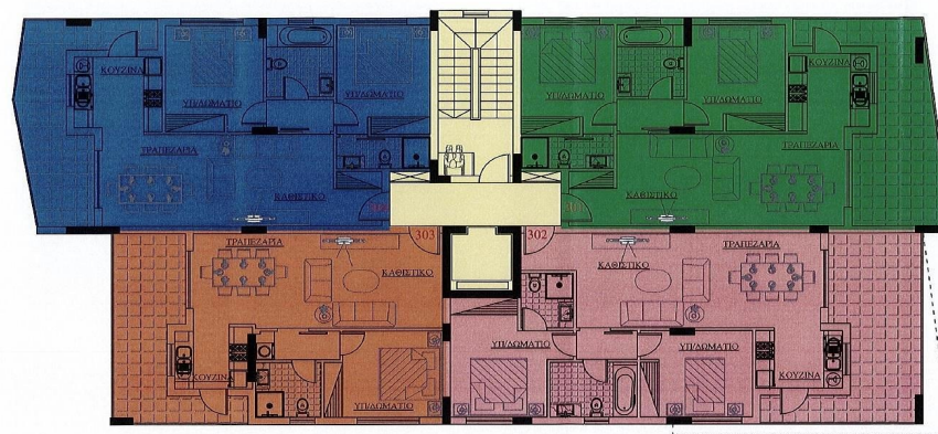
ΚΑΤΟΨΗ 3ου ΟΡΟΦΟΥ