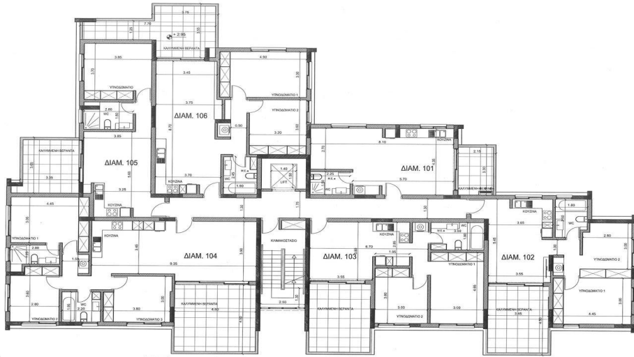
ΚΑΤΩΦΗ 1ΟΥ ΟΡΟΦΟΥ