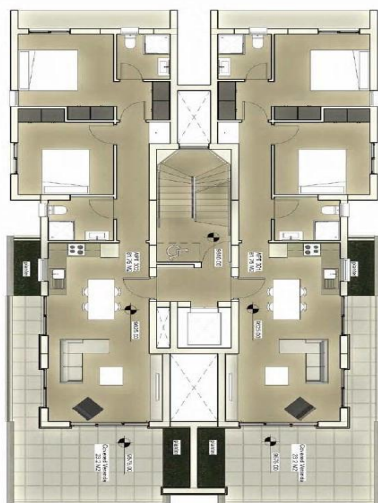
302 2 Bedrooms 2 Bathrooms 81.75 SQM Internal Area 23.2 SQM Covered Veranda