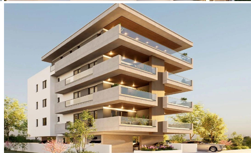
301 2 Bedrooms 2 Bathrooms 81.75 SQM Internal Area 23.2 SQM Covered Veranda