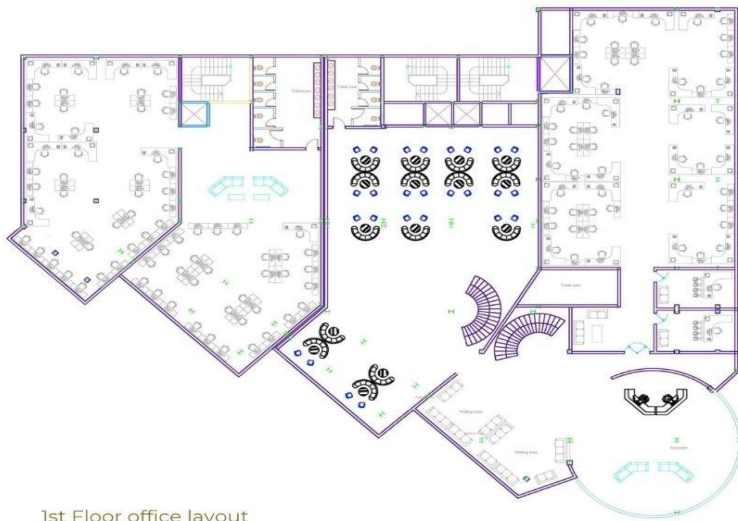
1st Floor office layout