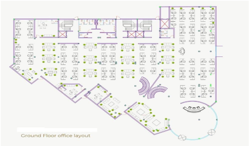
Ground Floor office layout