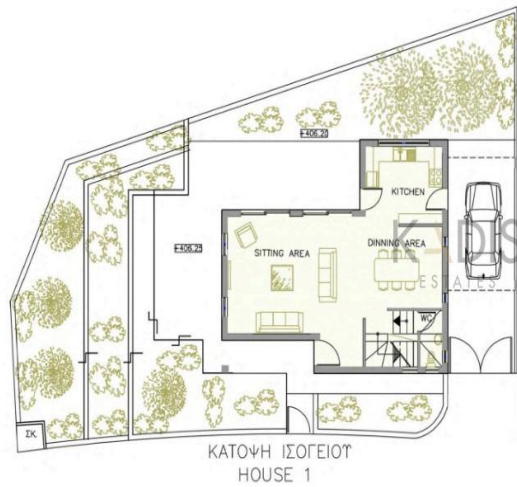
ΚΑΤΟΨΗ ΙΣΟΓΕΙΟΥ HOUSE 1