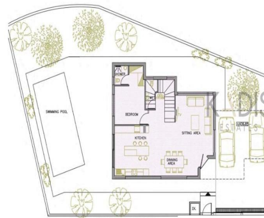
ΚΑΤΟΨΗ ΙΣΟΓΕΙΟΥ HOUSE 2