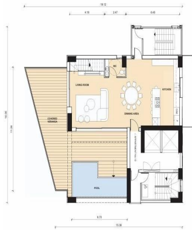
12th FLOOR PLAN SCALE 1:100