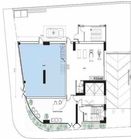
GROUND FLOOR PLAN SCALE 1:100