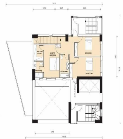
13th FLOOR PLAN SCALE 1:100