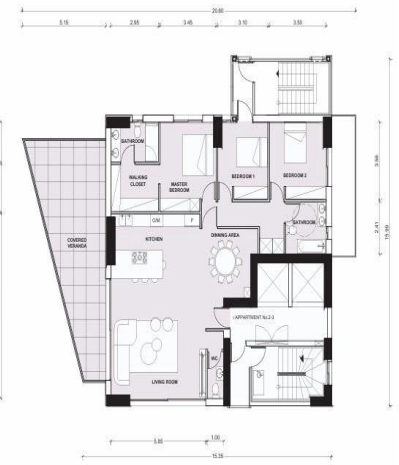
2nd-3rd FLOOR PLAN SCALE 1:100