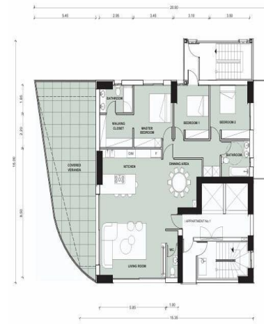
1st FLOOR PLAN SCALE 1:100