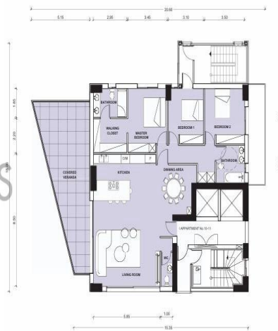
10th-11th FLOOR PLAN SCALE 1:100