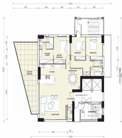
4th-9th FLOOR PLAN SCALE 1:100