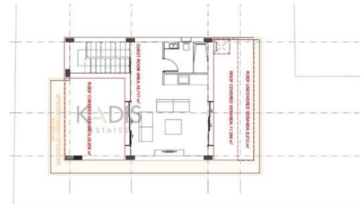
HOUSE C SECOND FLOOR