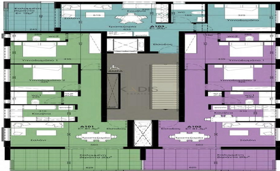
Κάτοψη 1ου ορόφου