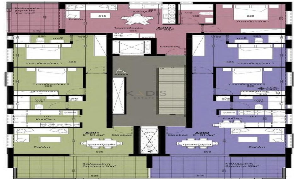
Κάτοψη 2ου ορόφου