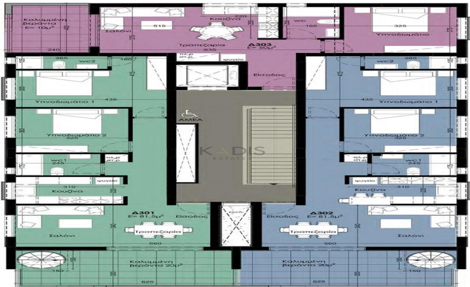
Κάτοψη 3ου ορόφου