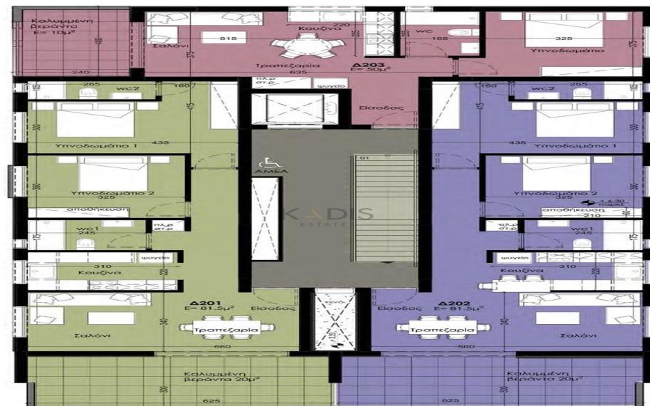
Κάτοψη 2ου ορόφου