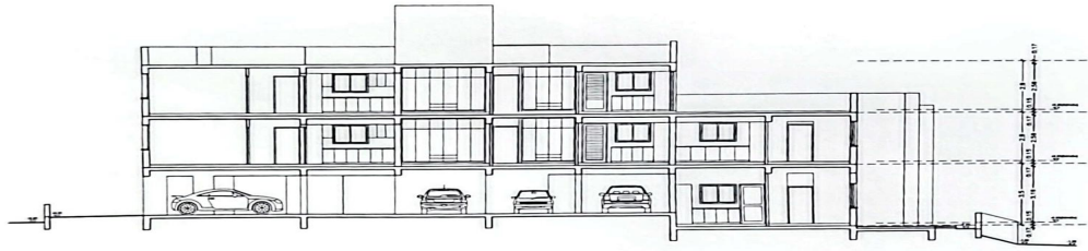
ΥΦΙΣΤΑΜΕΝΗ ΤΟΜΗ Α-Α