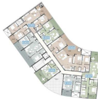
3rd floor Block E