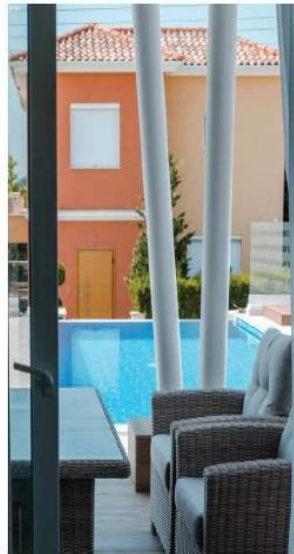
Exterior sitting area