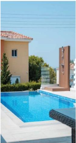
Swimming pool area