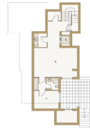
Lower ground floor