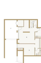
Lower ground floor - A5