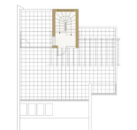
Roof terrace - A5