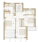
First floor - A5