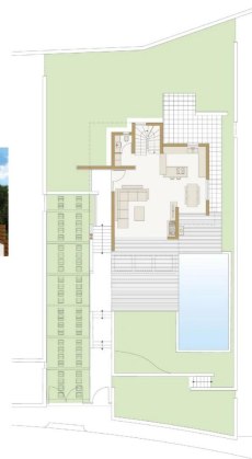
Landscape view - A5

*Suggested use: All rooms are for residential use only.