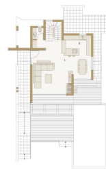
Ground floor - A5