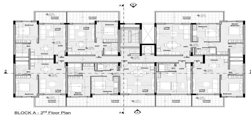
BLOCK A - 2nd Floor Plan