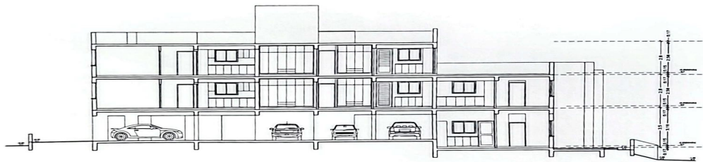
ΥΦΙΣΤΑΜΕΝΗ ΤΟΜΗ Α-Α