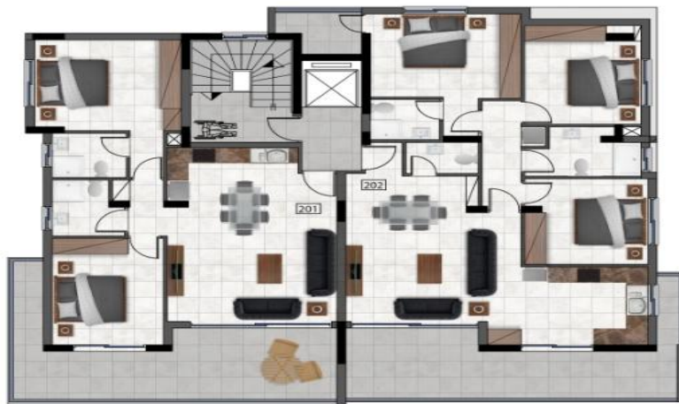
ΚΑΤΟΨΗ 2ου ΟΡΟΦΟΥ