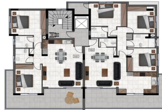
ΚΑΤΟΨΗ 1ου ΟΡΟΦΟΥ