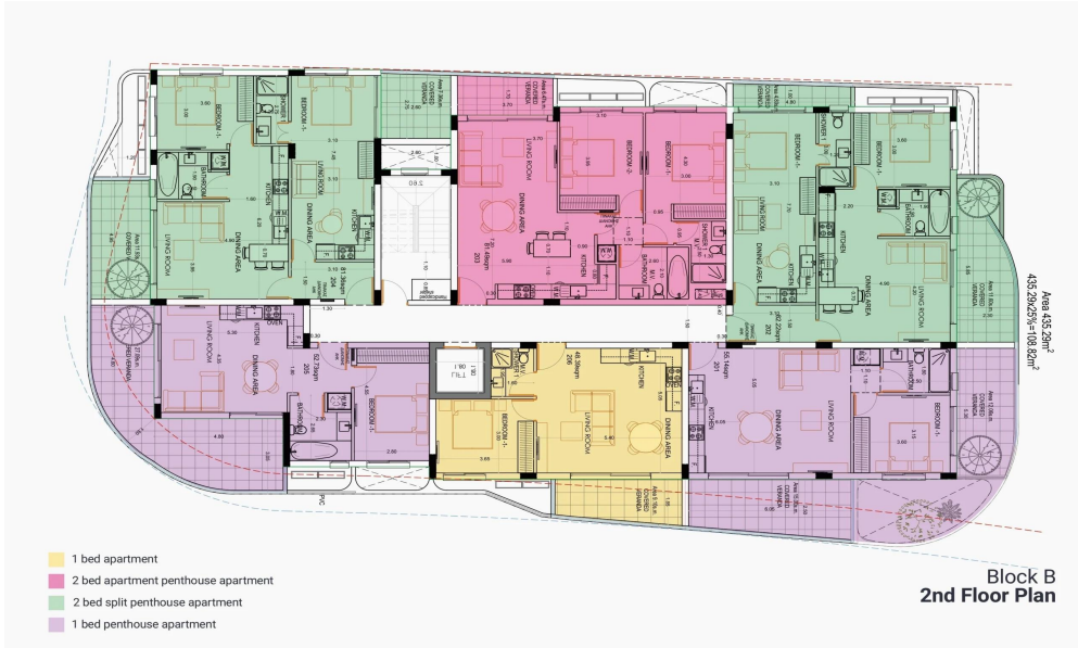
Block B 2nd Floor Plan