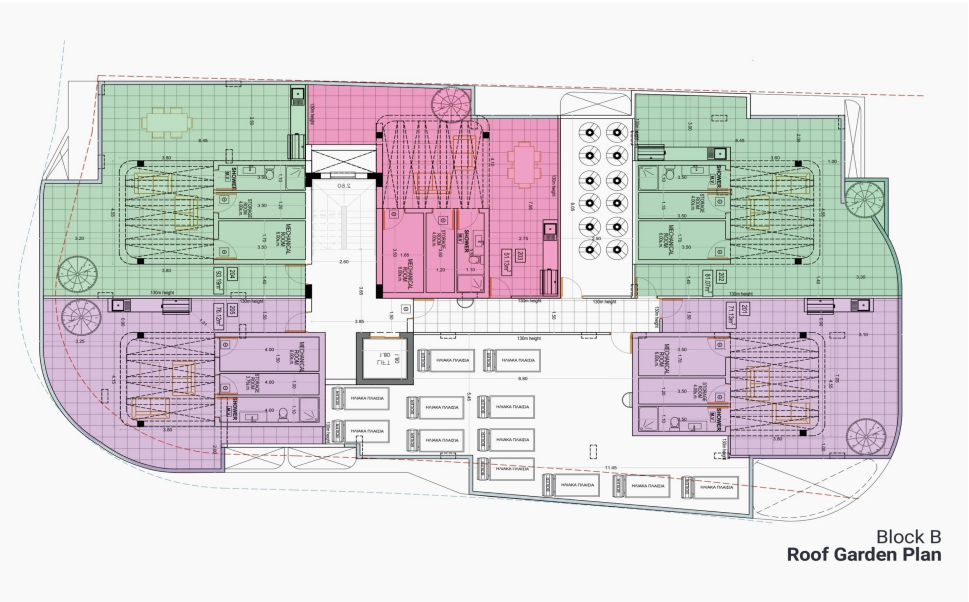
Block B Roof Garden Plan