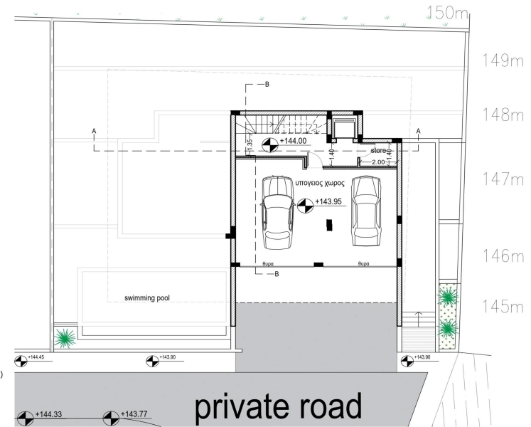
basement Es 25.28m 2 (-1.96m 2 ) Eut = 56.53m 2 Ecov.ver. = 30.50m 2