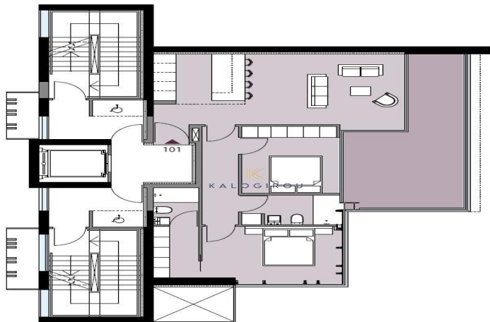
2 Bedroom Apartment