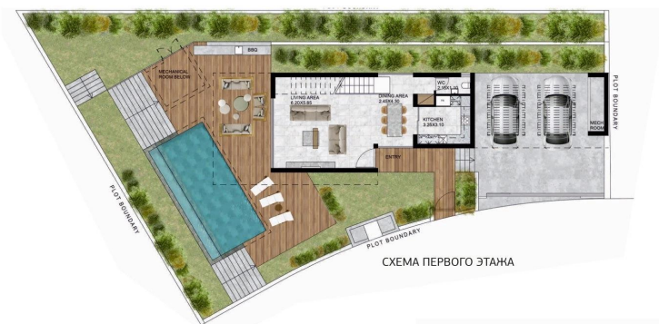
СХЕМА ПЕРВОГО ЭТАЖА