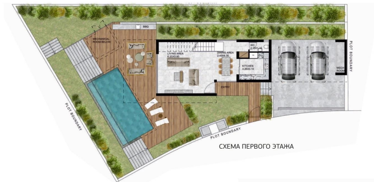
СХЕМА ПЕРВОГО ЭТАЖА