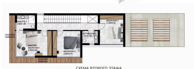
СХЕМА ВТОРОГО ЭТАЖА