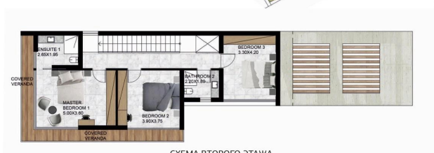
СХЕМА ВТОРОГО ЭТАЖА