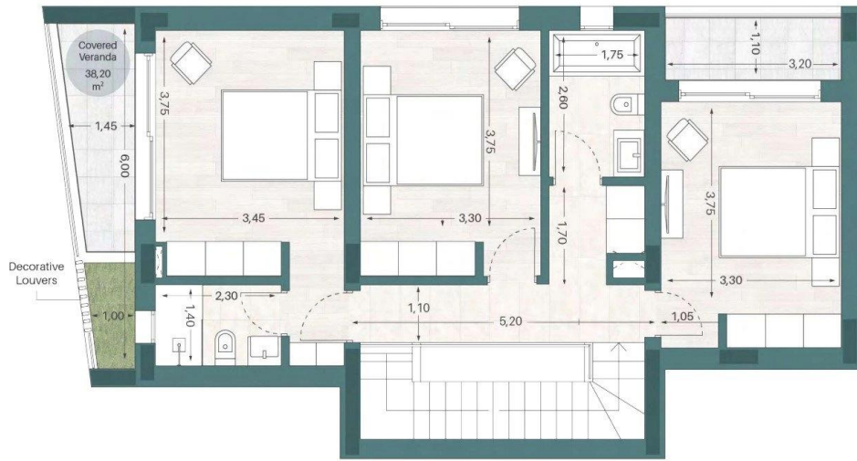
VILLA B 1ST FLOOR