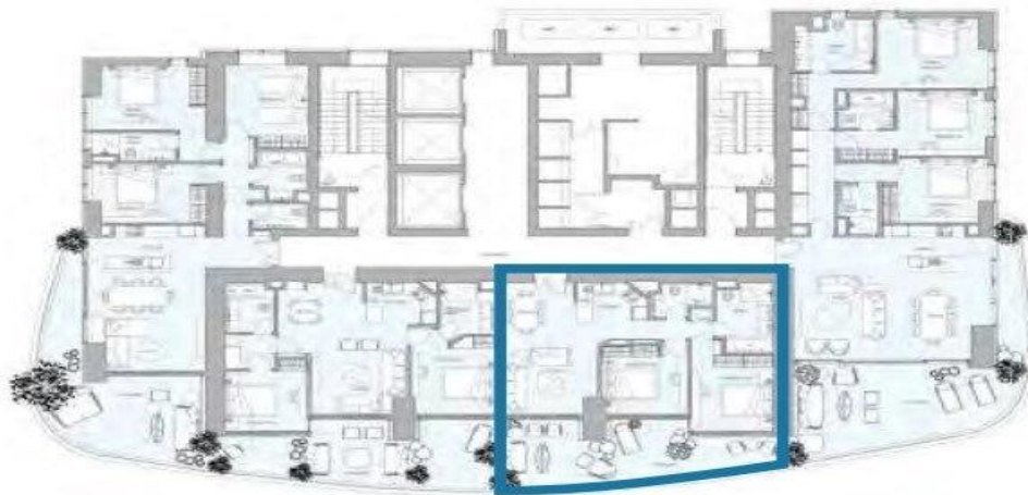
Preliminary Floor Plan