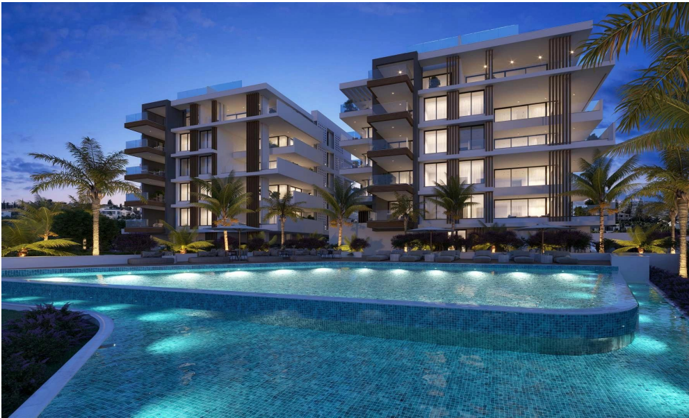
BLOCK A - B