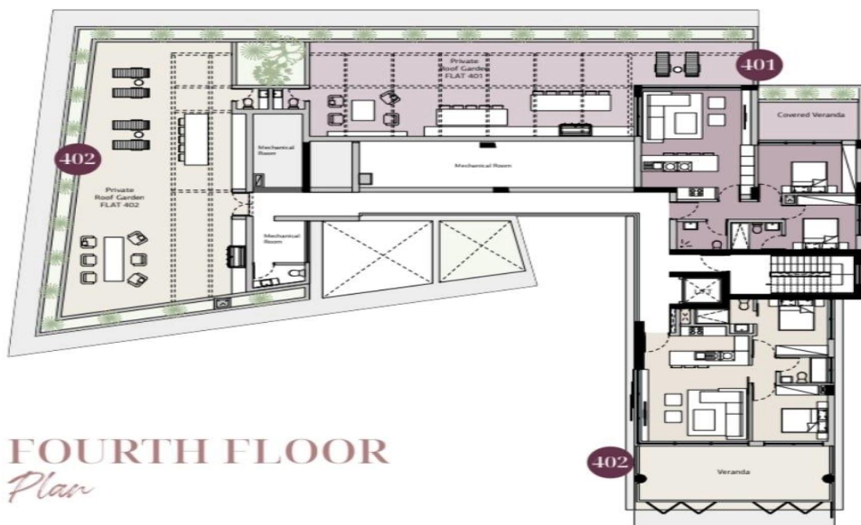
FOURTH FLOOR Plan